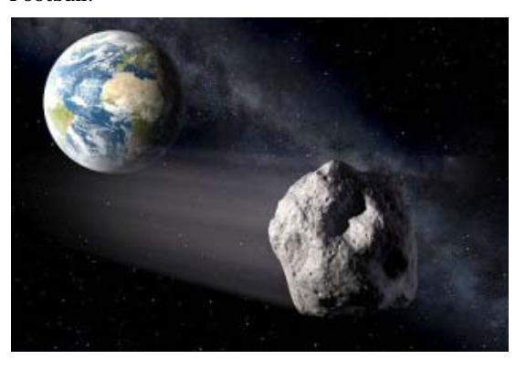
Media hype can tend to exaggerate the gravity of the situation.