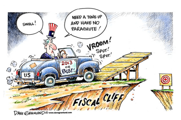
In reality, only those singles making over $400,000 and married over $450.000 will be affected.